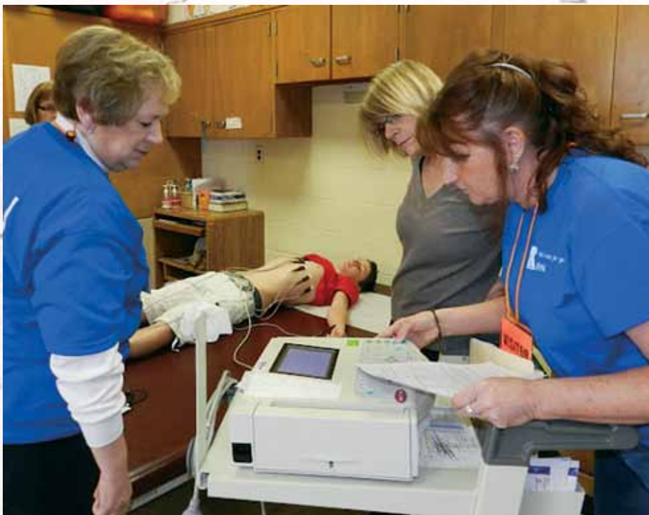
A team of volunteers from FHN and Freeport High School prepare to get an electrocardiogram reading of a student's heart activity during the recent screening.