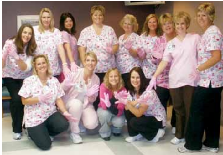
Heal • Care • Believe • Cure • Love