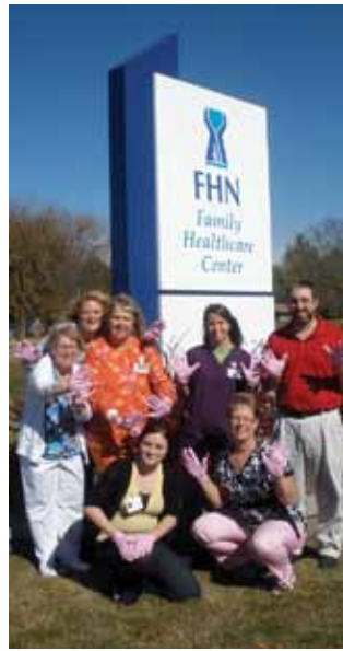
Courage • Hope