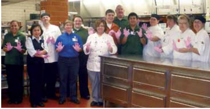
Grow • Live • Faith • Survive • Fight