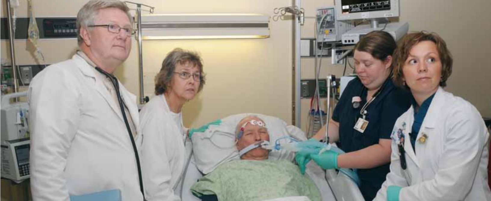
Simulated medical situation.