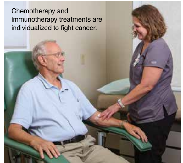
Chemotherapy and immunotherapy treatments are individualized to fight cancer.

You've probably heard of the 4 C's in regard to buying a diamond—judging stones by their cut, color, clarity, and carat weight can help you find the best sparkler for your ring.