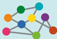
CONNECT the D.O.T.S. Doors Of Team Support

Through the Connect the DOTS (Doors Of Team Support) initiative, FHN also partners with dozens of community agencies and organizations to help individuals who may not otherwise be able to improve or even maintain their health and well-being on their own or find the support they need. FHN is leading this effort with the involvement of many other partners, from first responders to transportation providers to various agencies whose missions include the type of expanded assistance these people need. As we work with them, we know that we are also improving the well-being of our whole community by reducing the impact—and cost—of ineffective connections between our organizations which also can result in inefficient use of the overall community's limited resources, from time to dollars to human expertise.