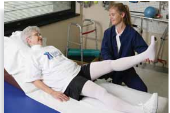
Joint replacement patients may begin their physical therapy the day of their surgery. The best way to heal is to use the new joint.